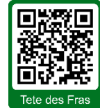
Tete des Fras