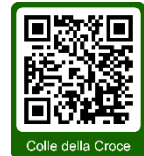
Colle della Croce